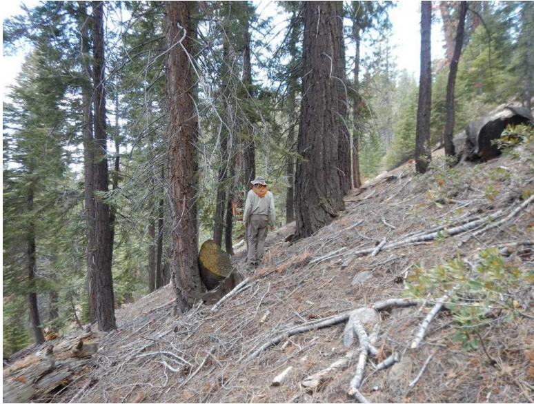
Figure 4. Steep trail location – Northern Section

Instead, most of the trail route leaves the old roadbed on the northern section and traverses very steep terrain, including many rock outcrops, chinquapin and manzanita fields, and even groves of live trees, which would need to be cleared or felled to make way for the proposed trail. Typical views of these steep sloped areas are illustrated in Figures 4 and 5 below.