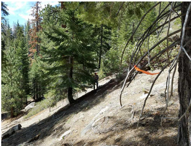
Figure 5. Steep trail location – Southern Section

For a full set of photographs of the proposed trail route on these steep slopes, please click the following link, which opens a Google Docs web page after logging in with a Google account: https://drive.google.com/drive/folders/1uoSol2-RDgrFGgvbBQnsKs0ipw9YspBs . Each image is geo-referenced and locations are indicated on the attached map. See Exhibit B.