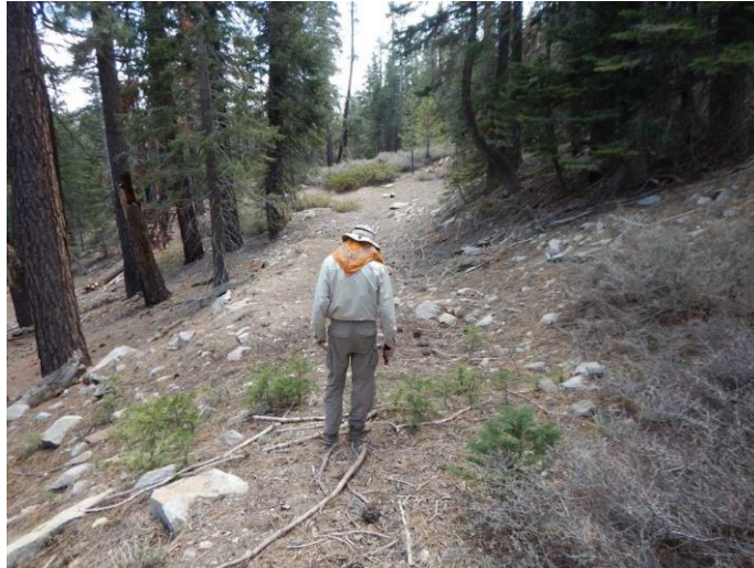
Figure 2. Well-defined roadbed – Northern Section

SFK followed the orange flagging along the entire trail route west of Long Meadow, which indicates its proposed location. The current proposed trail location would use steep terrain roughly 300-500 feet upslope from the edge of the meadow. It is perplexing why this steep hillside location is proposed when the area includes a well-defined old roadbed lower down the slope, which would make a more suitable trail route for OHVs. See Map Exhibit 1 (attached) and Figures 2 and 3 below.