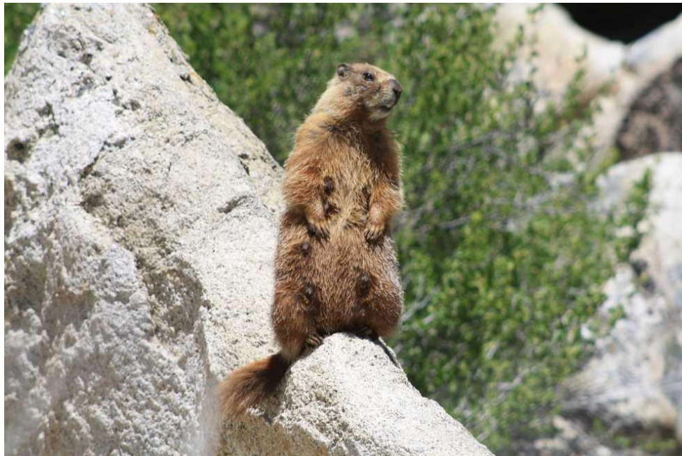
Figure 1. Yellow-bellied marmot, observed along proposed trail route near Big Meadow on May 31, 2018

White-tailed jackrabbits and yellow-bellied marmots are known to occur within the trail corridor and could be impacted by habitat disturbance and noise from construction and use by OHVs.